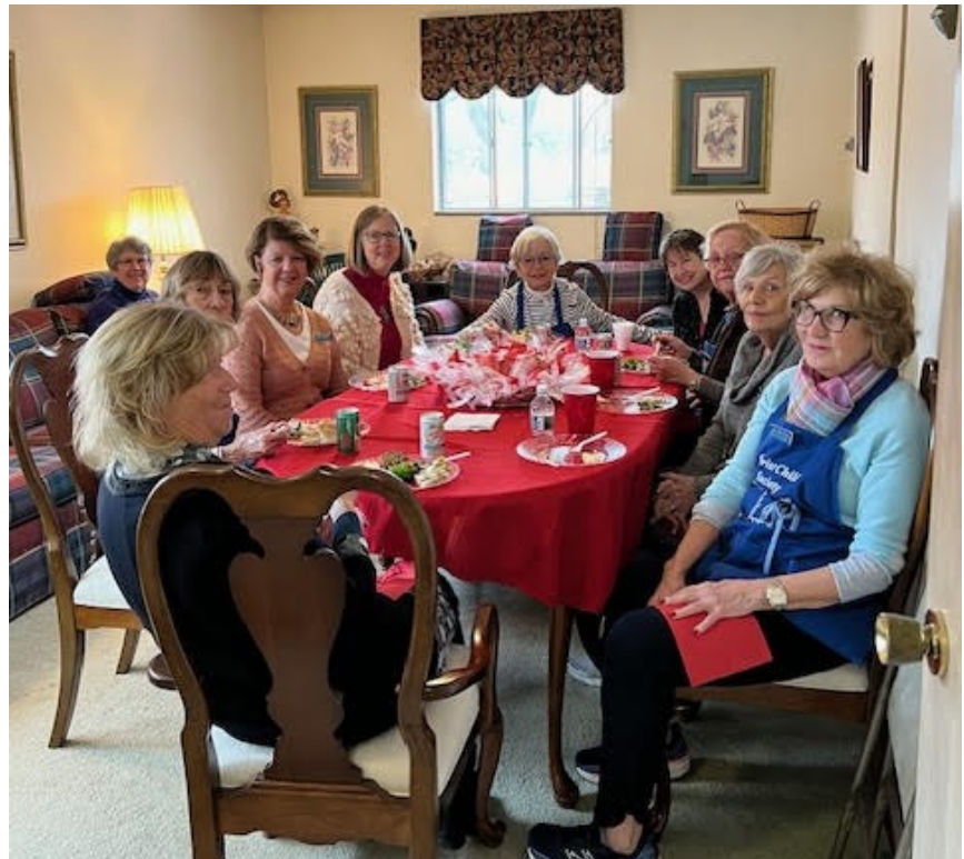
Volunteers gather for our annual worker lunch