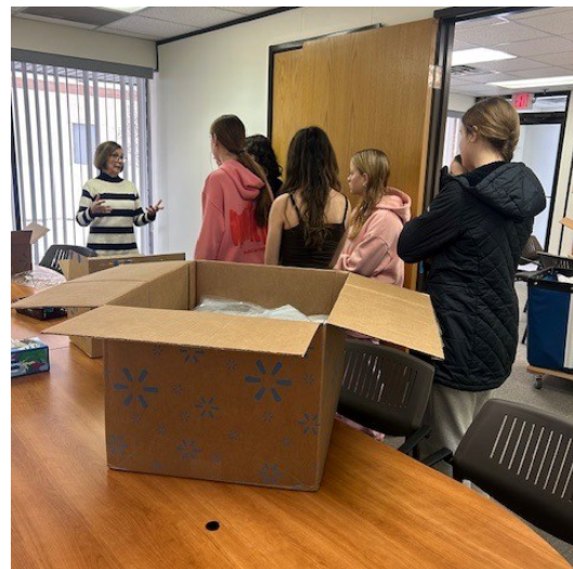
DSHA students help sort the essential pieces that will soon become part of the beautiful layettes we deliver to local agencies for moms and newborns in need.